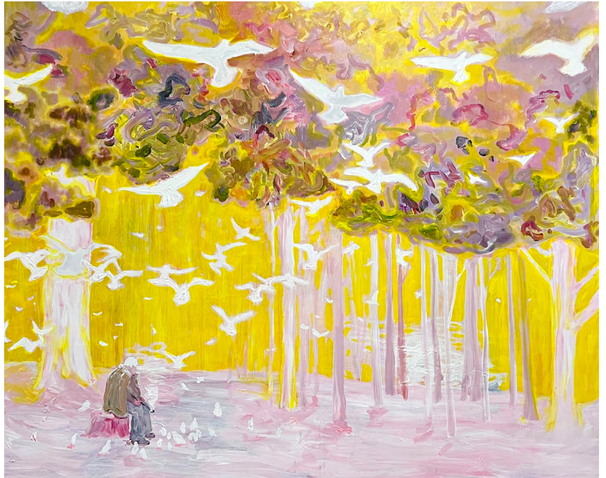
Xi Zhang Smoke Ring , 2019–2022 Acrylic on canvas 58 x 72 in (147.3 x 182.9 cm)

An opening reception will be held on Saturday, February 17 from 4 to 7 PM. The artist will be present. Gallery opening hours are Tuesday through Sunday, 11 AM to 6 PM.